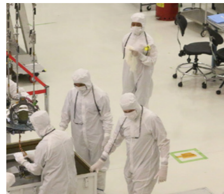
PHARMACEUTICAL & COSMETICS