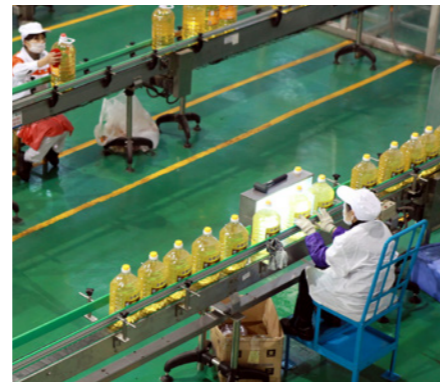
FOOD & BEVERAGE PROCESSING INDUSTRY