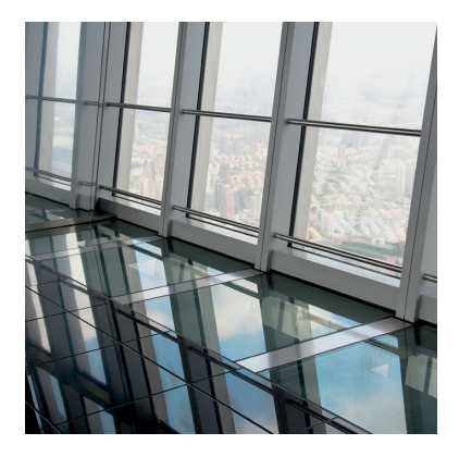
Expressing steel as an architectural feature can be an intrinsic part of modern architecture.