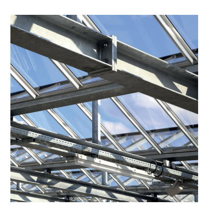
Reduce your application time and reduce your site costs.