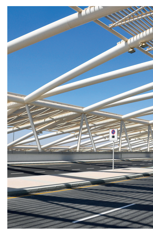
Cairo International Airport, Terminal 3 – protected by SteelMaster

The Jotun Group is one of the world's leading manufacturers of paints, coatings and powder coatings. Jotun's operations ensure the very best in paint systems and products to protect and decorate surfaces in the residential, shipping and industrial markets. Everything we do, from development to production, marketing, sales and consultancy for various paint systems and products to protect the property of our customers the world over.